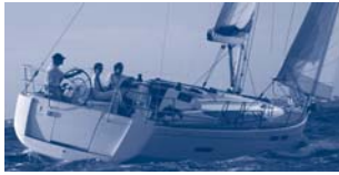
Sun Odyssey 409