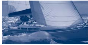
Sun Odyssey 42i